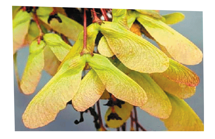
Maple fruit are winged samaras